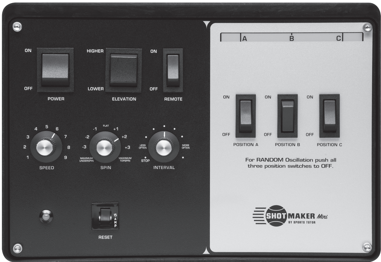
Shotmaker Mini Standard Model Control Panel