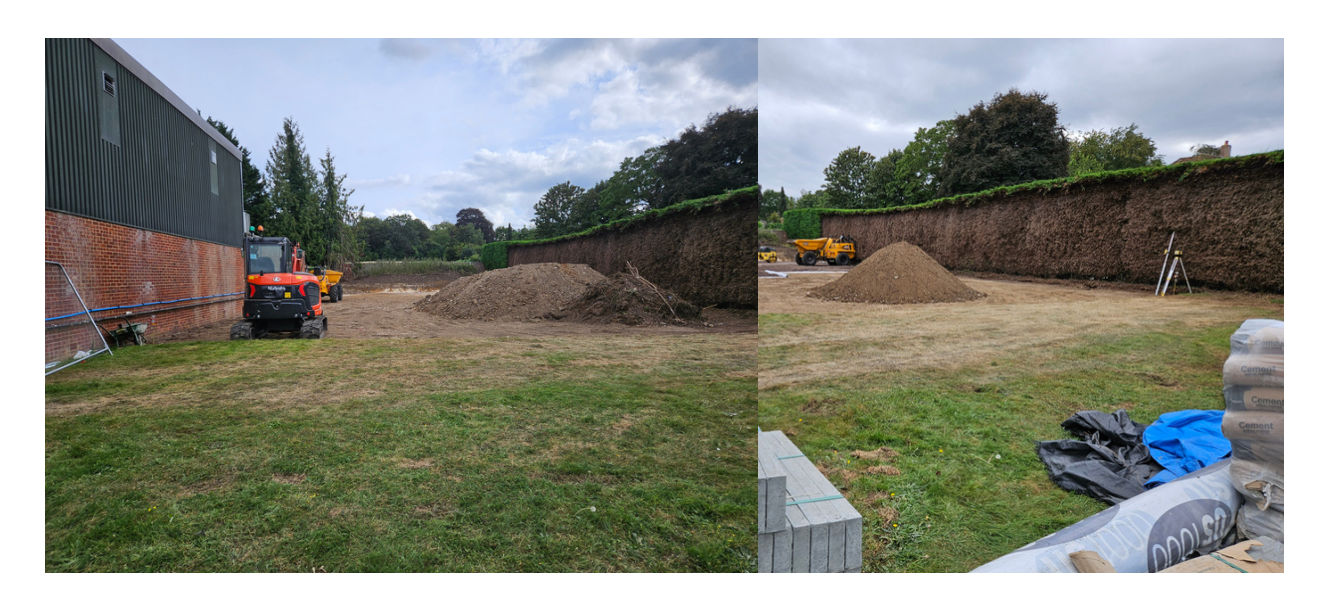
Building of the 7th Court