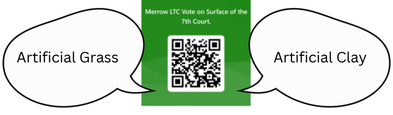
Voting closes on Tuesday 31st October

Please vote using the link or QR code below https://forms.office.com/r/RCSmaCEQSp