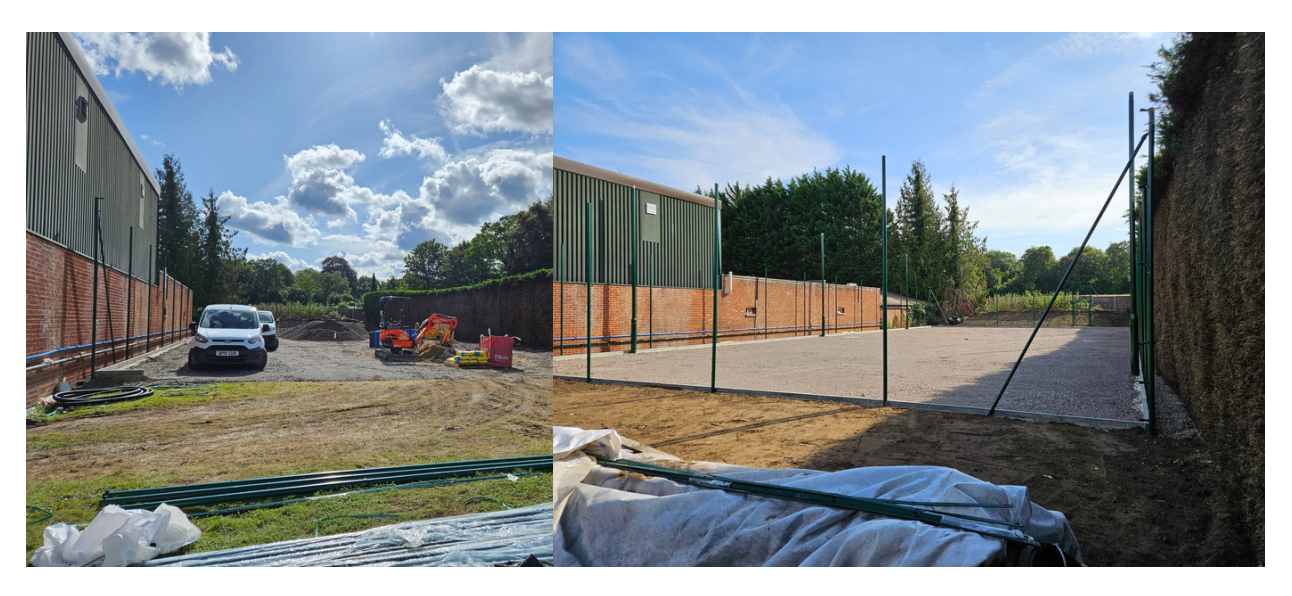
the story so far...